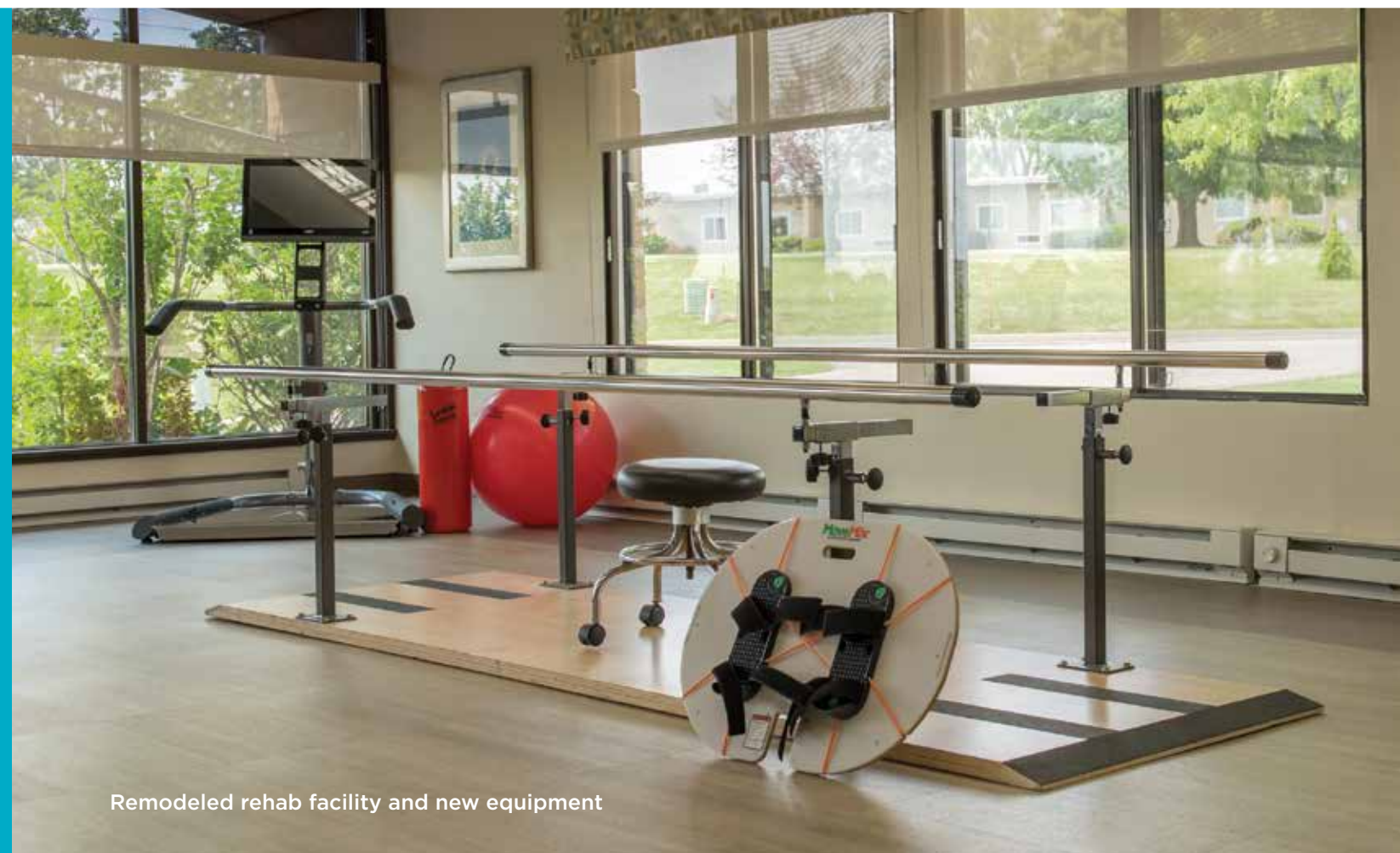
Remodeled rehab facility and new equipment