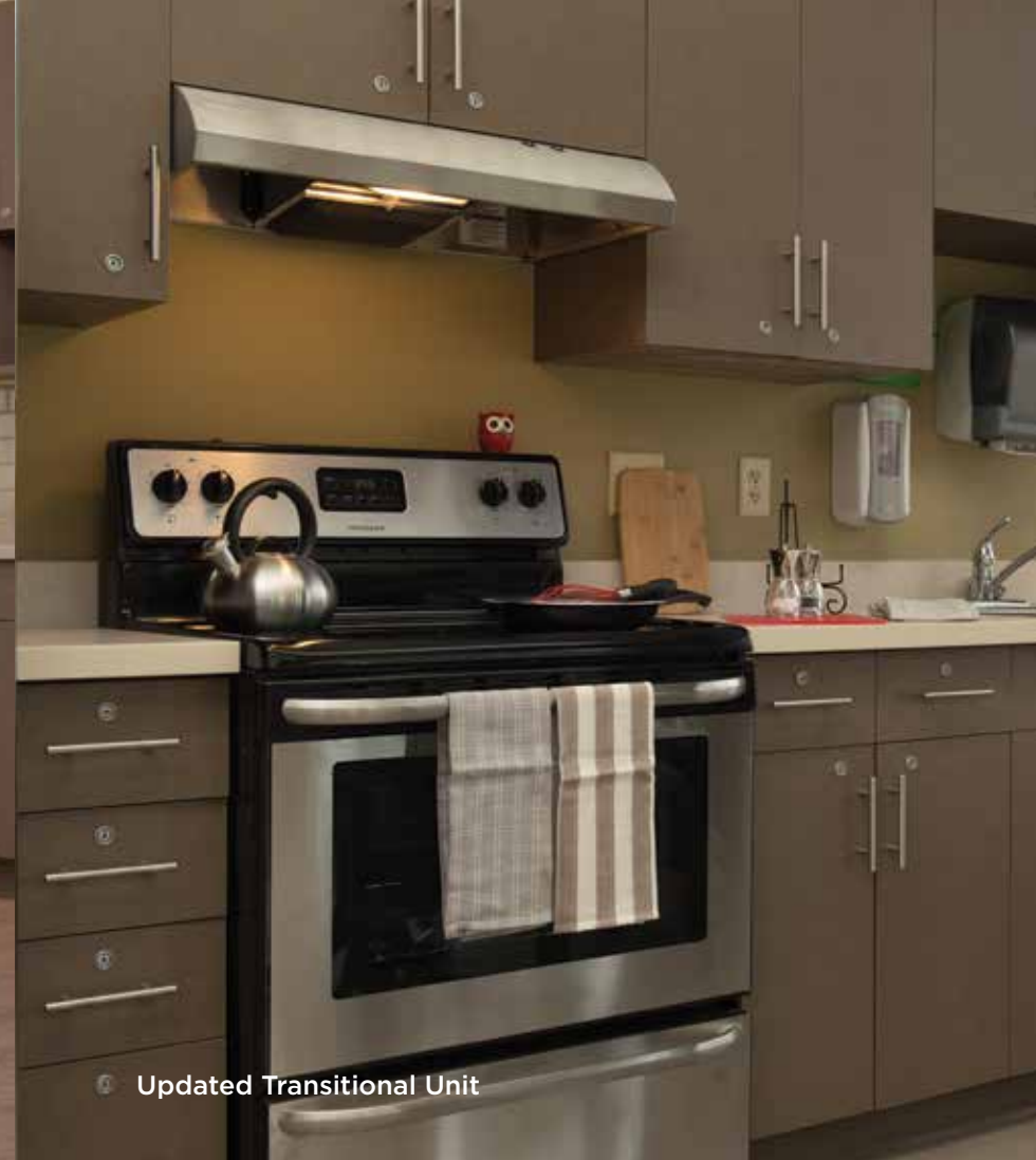
Updated Transitional Unit