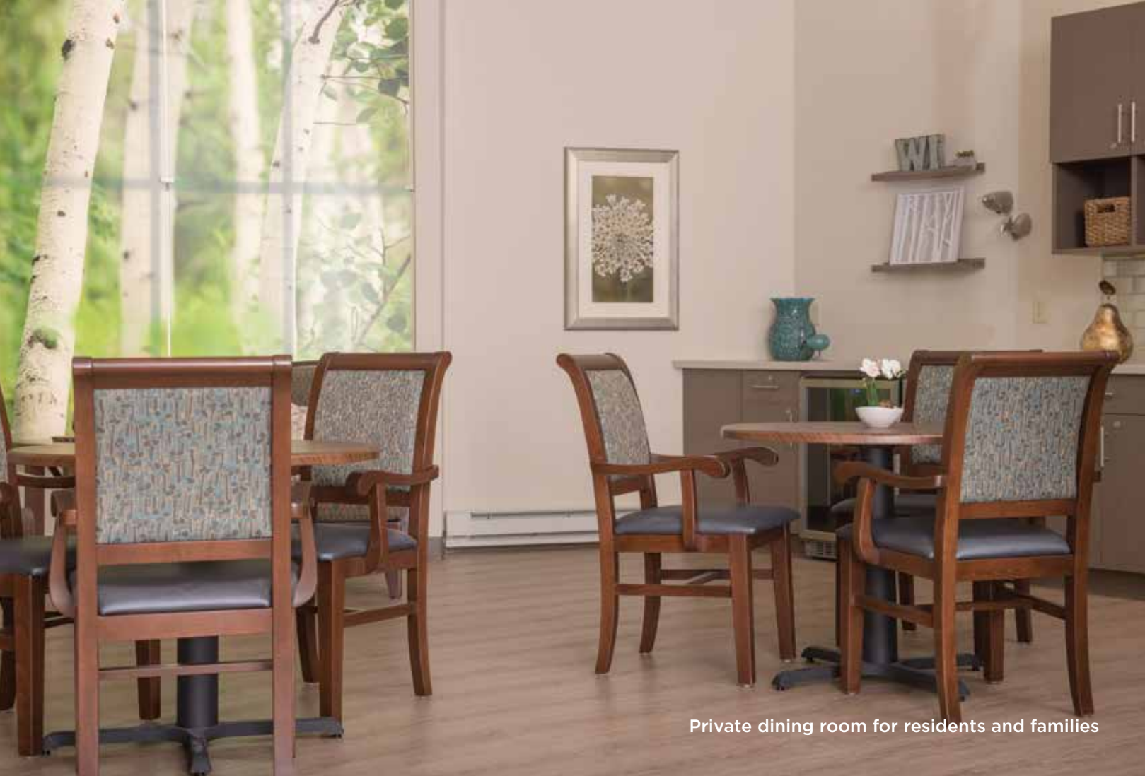
Private dining room for residents and families