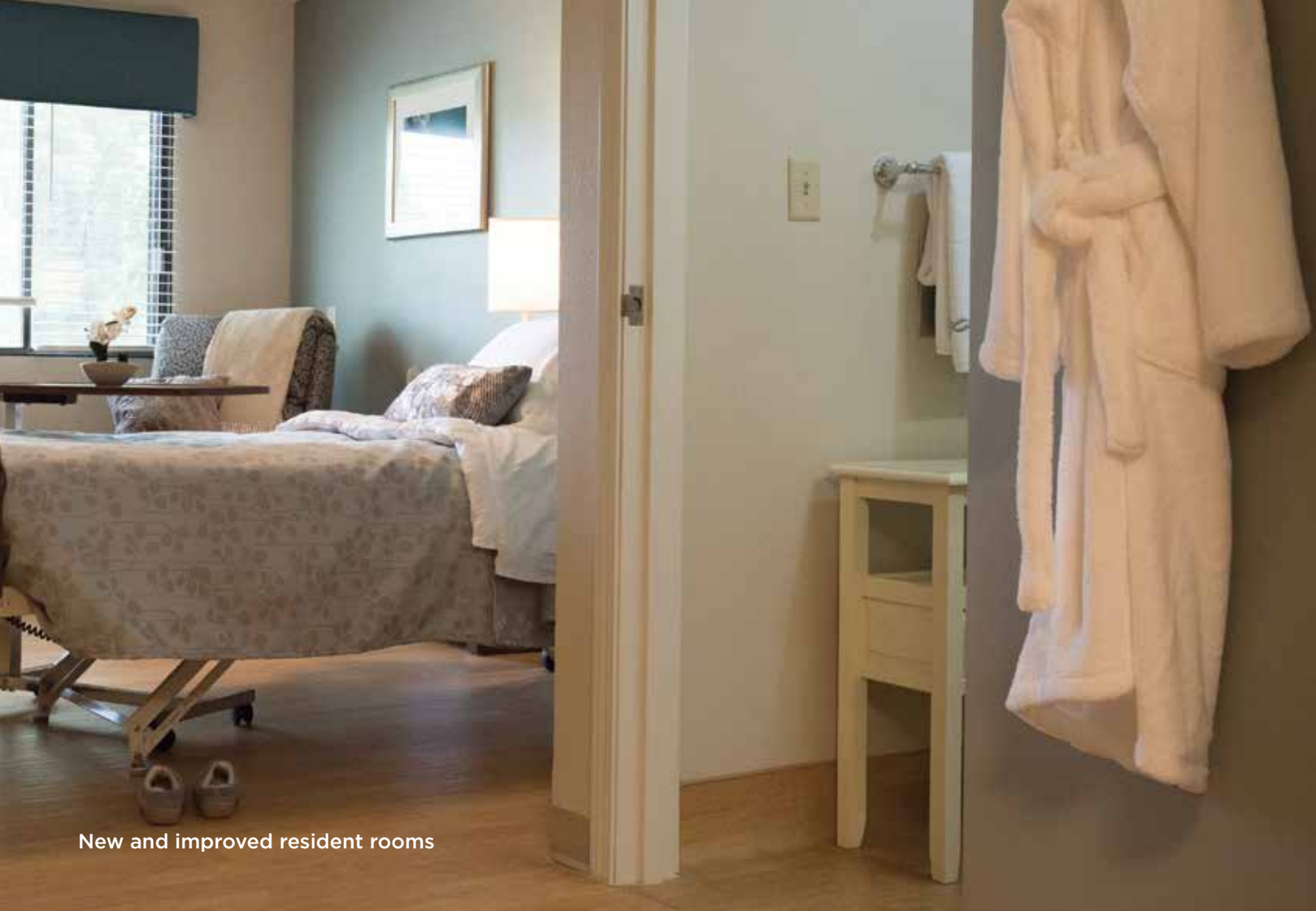
New and improved resident rooms