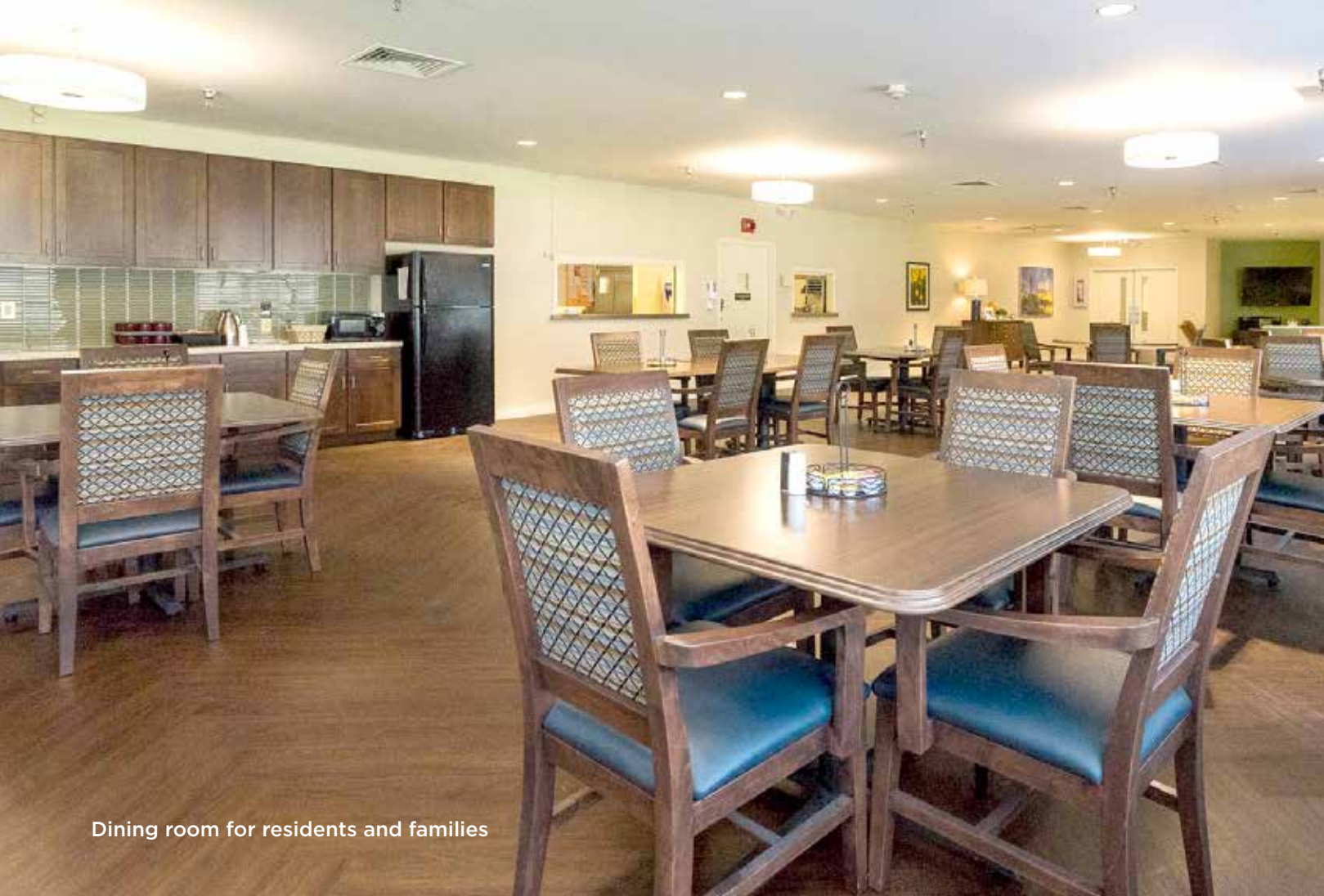
Dining room for residents and families