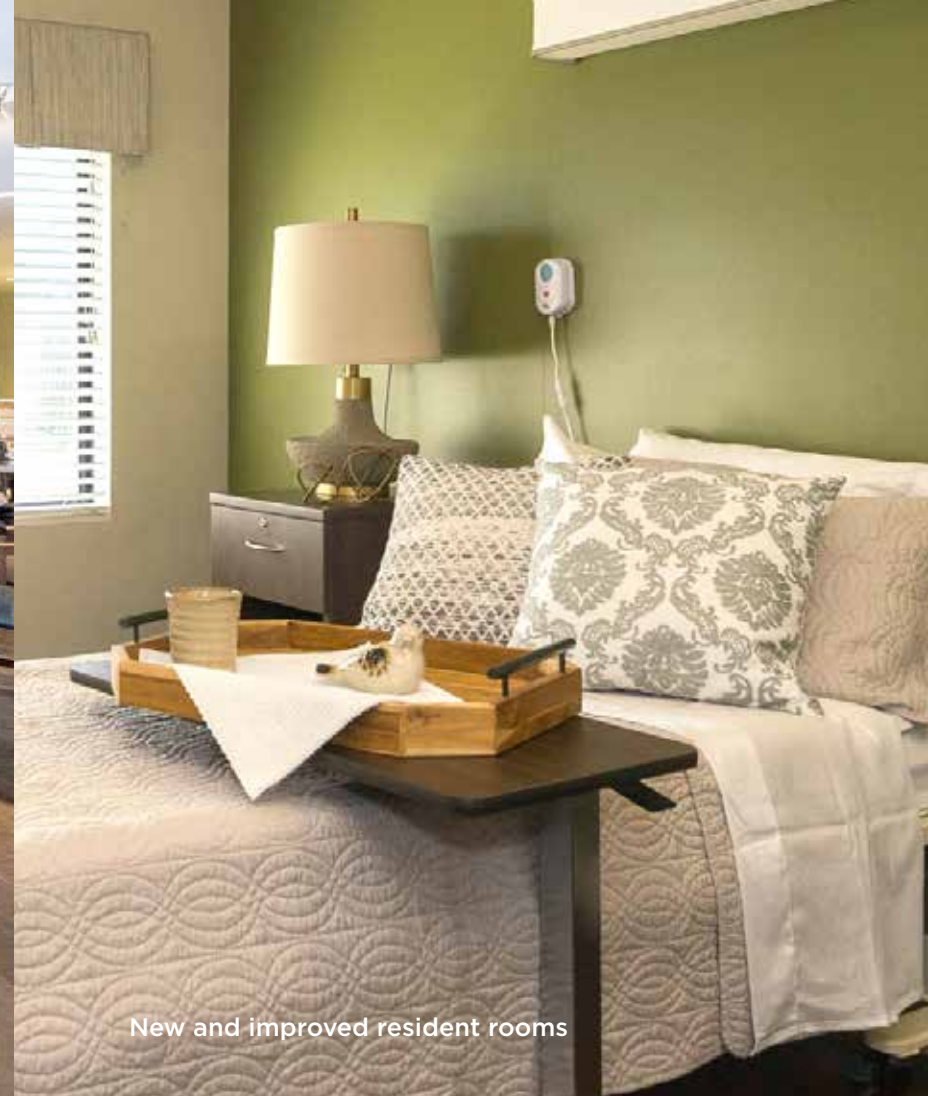
New and improved resident rooms